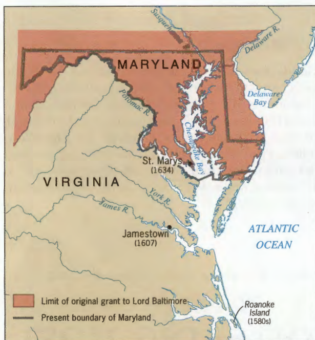
Early Maryland and Virginia

Absentee proprietor Lord Baltimore hoped that the two hundred settlers who founded Maryland at St. Marys, on Chesapeake Bay, would be the vanguard of a vast new feudal domain. Huge estates were to be awarded to his largely Catholic relatives, and gracious manor houses, modeled on those of England's aristocracy, were intended to arise amidst the fertile forests. As in Virginia, colonists proved willing to come only if offered the opportunity to acquire land of their own. Soon they were dispersed around the Chesapeake region on modest farms, and the haughty land barons, mostly Catholic, were surrounded by resentful backcountry planters, mostly Protestant. Resentment flared into open rebellion near the end of the century, and the Baltimore family for a time lost its proprietary rights.