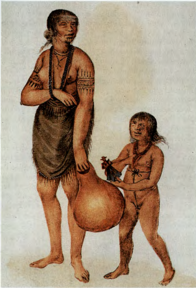
A Carolina Indian Woman and Child, by John White The artist was a member of the Raleigh expedition of 1585. Notice that the Indian girl carries a European doll, illustrating the mingling of cultures that had already begun.

They were again defeated. The peace treaty of 1646 repudiated any hope of assimilating the native peoples into Virginian society or of peacefully coexisting with them. Instead it effectively banished the Chesapeake Indians from their ancestral lands and formally separated Indian from white areas of settlement—the origins of the later reservation system. By 1669 an official census revealed that only about two thousand Indians remained in Virginia, perhaps 10 percent of the population the original English settlers had encountered in 1607. By 1685 the English considered the Powhatan peoples extinct.