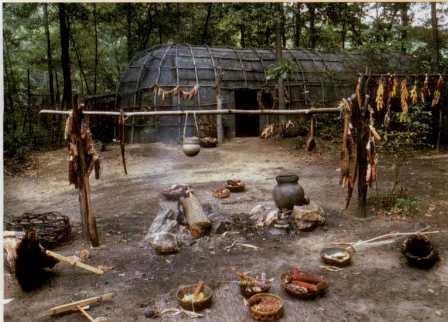
The Longhouse (reconstruction) The photo shows a modern-day reconstruction of a Delaware Indian longhouse (almost identical in design and building materials to the Iroquois longhouses), at Historic Waterloo Village on Winakung Island in New Jersey. (The Iroquois conquered the Delawares in the late 1600s.) Bent saplings and sheets of elm bark made for sturdy, weather-tight shelters. Longhouses were typically furnished with deerskin-covered bunks and shelves for storing baskets, pots, fur pelts, and corn.

Reservation life proved unbearable for a proud people accustomed to domination over a vast territory. Morale sank; brawling, feuding, and alcoholism became rampant. Out of this morass arose a prophet, an Iroquois called Handsome Lake. In 1799 angelic figures clothed in traditional Iroquois garb appeared to Handsome Lake in a vision and warned him that the moral decline of his people must end if they were to endure. He awoke from his vision to warn his tribespeople to mend their ways. His socially oriented gospel inspired many Iroquois to forsake alcohol, to affirm family values, and to revive old Iroquois customs. Handsome Lake died in 1815, but his teachings, in the form of the Longhouse religion, survive to this day.