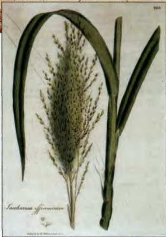
(above) Sugar Mill in Brazil, by Frans Post, c. 1640 (left) Saccharum Officinarum (sugar cane)

To control this large and potentially restive population of slaves, English authorities devised formal “codes” that defined the slaves’ legal status and masters’ prerogatives. The notorious Barbados slave code of 1661 denied even the most fundamental rights to slaves and gave masters virtually complete control over their