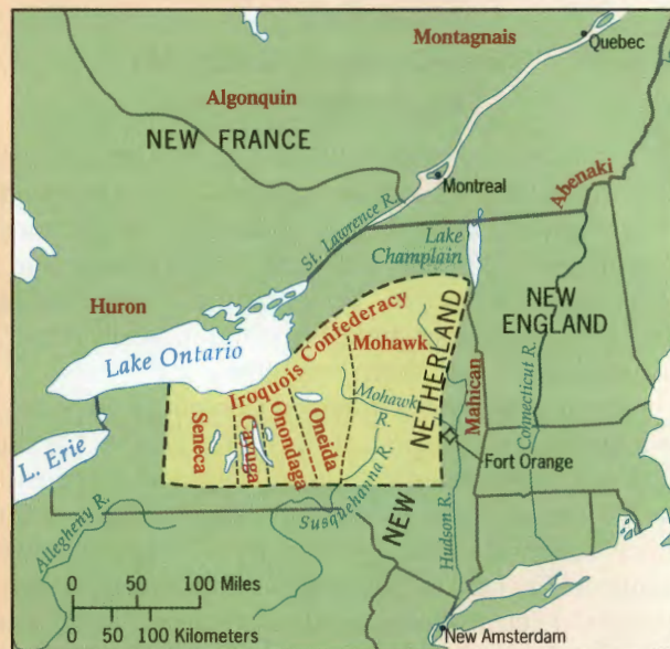
Iroquois Lands and European Trade Centers, c. 1590–1650

The building block of Iroquois society was the longhouse (see photo p. 41). This wooden structure deserved its descriptive name. Only twenty-five feet in breadth, the longhouse stretched from eight to two hundred feet in length. Each building contained three to five fireplaces around which gathered two nuclear families, consisting of parents and children. All families residing in the longhouse were related, their connections of blood running exclusively through the maternal line. A single longhouse might shelter a