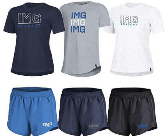
Core Package (Women)