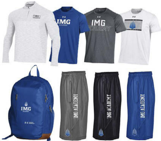
Elite Package (Men)