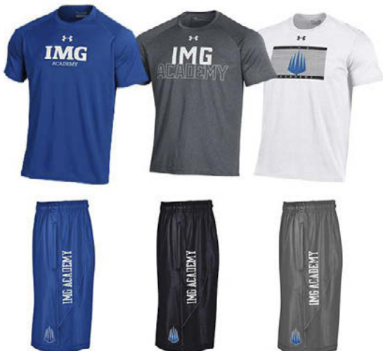
Core Package (Men)