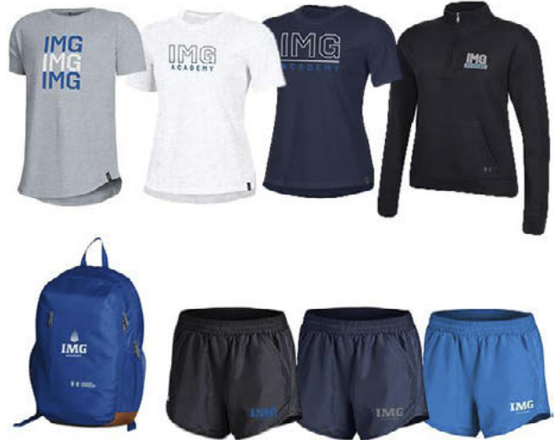
Elite Package (Women)