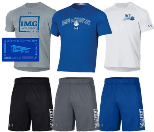
MALE CORE PLUS GIFT CARD PACKAGE - $320

Contact your Customer Support Specialist to pre-purchase your Under Armour gear package to be picked up at check-in. If you are wondering what to bring, Shop IMG Academy offers official IMG Academy Under Armour training packages that can be viewed online before you arrive so that you have everything you will need to maximize your training on and off campus. Packages can be ordered online at Shop.IMGAcademy.com or see a sales associate in store to purchase.