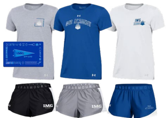
FEMALE CORE PLUS GIFT CARD PACKAGE - $320